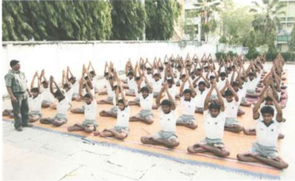
श्री. हनुमान व्यायाम प्रसारक मंडळातर्फे आयोजित शेतकरी युवक प्रशिक्षण शिबिरातील युवक, योगाचे प्रशिक्षण घेतांना