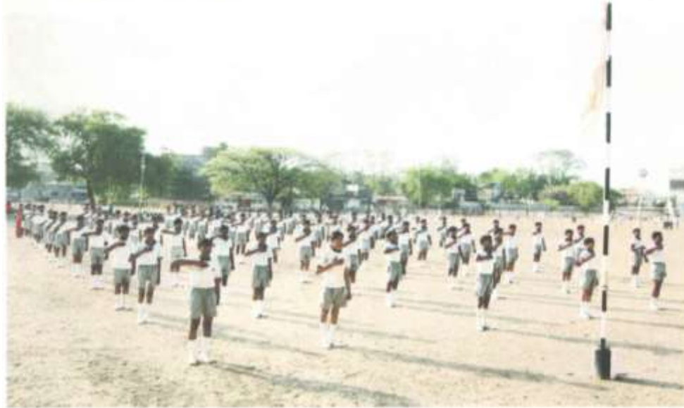
श्री. हनुमान व्यायाम प्रसारक मंडळातर्फे आयोजित शेतकरी युवक प्रशिक्षण शिबिरातील युवक, ध्वज मानवंदना देतांना