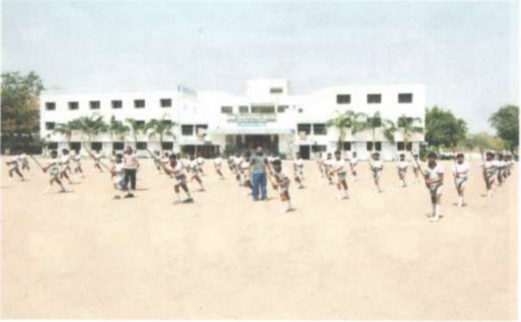
श्री. हनुमान व्यायाम प्रसारक मंडळातर्फे आयोजित शेतकरी युवक प्रशिक्षण शिबिरातील युवक, लाठीकाठीचे प्रशिक्षण घेतांना