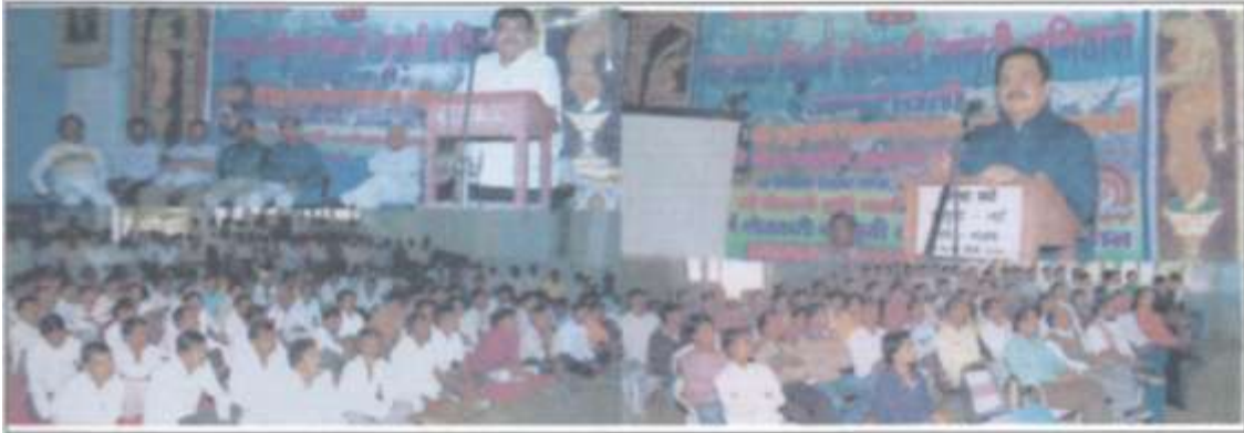
मा. ना. श्री. नितीनजी गडकरी, परिवहन व रस्ते विकास मंत्री, भारत सरकार शेतकरी बांधवांना मार्गदर्शन करतांना