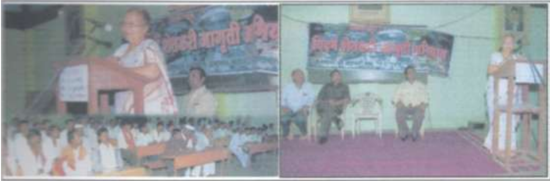
लोकसभा अध्यक्ष मा. ना. सुमित्रा महाजन शेतकरी बांधवांना मार्गदर्शन करतांना