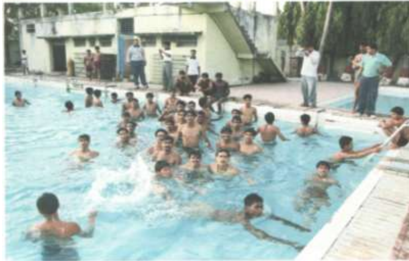
श्री. हनुमान व्यायाम प्रसारक मंडळातर्फे आयोजित शेतकरी युवक प्रशिक्षण शिबिरातील युवक, मंडळाच्या जलतरण तलावावर पोहण्याचे प्रशिक्षण घेताना