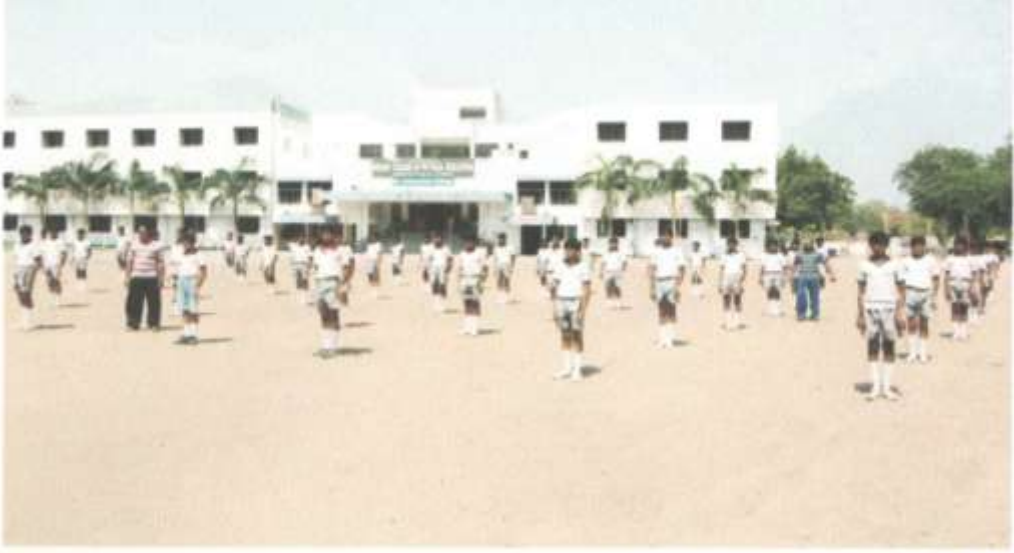
श्री. हनुमान व्यायाम प्रसारक मंडळातर्फे आयोजित शेतकरी युवक प्रशिक्षण शिबिरातील युवक, लाठीकाठीचे प्रशिक्षण घेतांना