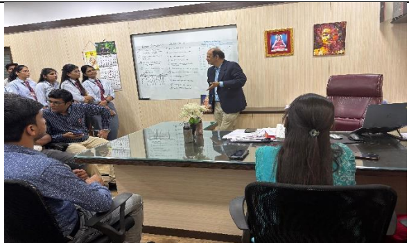
Students Interact with Startup India Co-ordinator