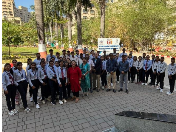
Visit at MIT PUNE campus.