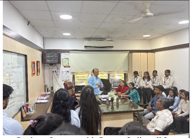
Students Interact with Startup India cell In charge.