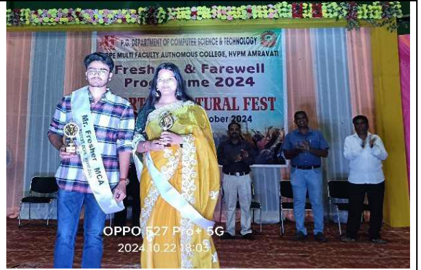
Freshers-Farwell Award ceremony