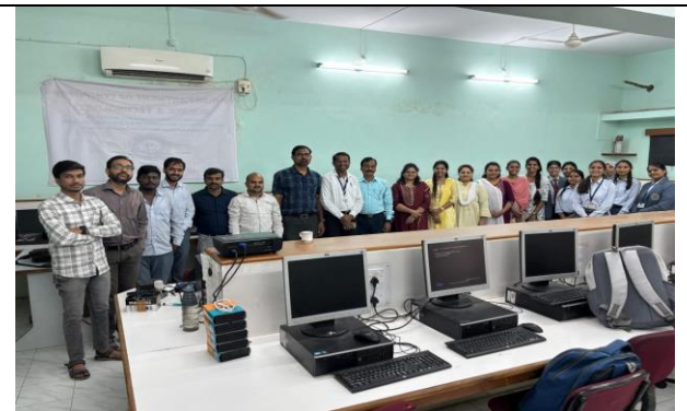
Workshop On IOT –By Mangesh Bharti