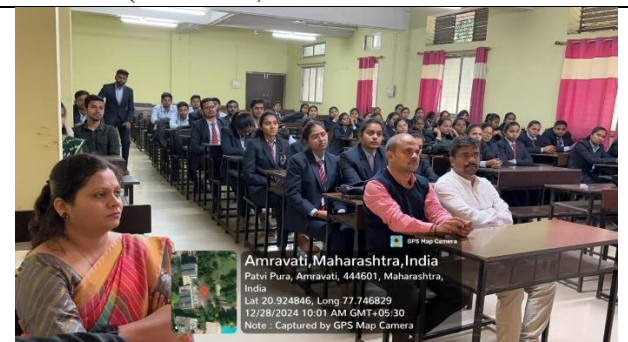
Placement Drive for The Kiran Academy PVT. Ltd., Pune