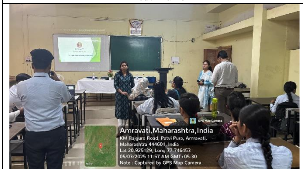
Geust Lecture On Awarness About Linkdin Platform By LitsBros Pvt. Ltd, Amravati