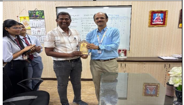
Presenting the Memento to Startup India Co-ordinator