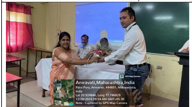
Placement Drive For MCA Student Skills IT Pvt. Ltd. Pune