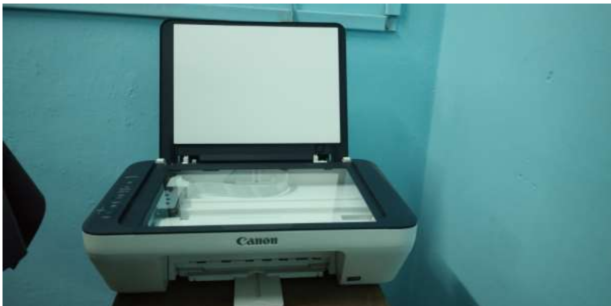
Scanner cum printer